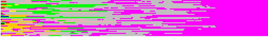
(b) Another simulation of the consensus game on Zachary's karate network for 1000 steps.